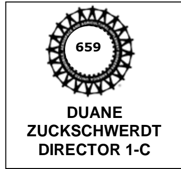
Double Brick w/Logo

Order your brick by completing the form below. To insure accuracy, you should either type or clearly print the information. Please use a separate form for each brick order. Payment, in full, must be sent with the order. Payment can be made by check or money order made out to "The MCC Labor Museum Fund."